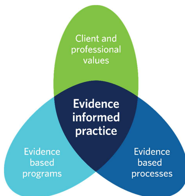
Figure 1: Evidence-informed practice and its components

While there is general agreement about what the key sources of evidence are, there is no consensus on what they should be called. In this paper, we refer to the three sources of evidence as evidence-based programs, evidence-based processes, and client and professional values and beliefs, and to the overall process as evidence-informed practice, as shown in the Figure 1.